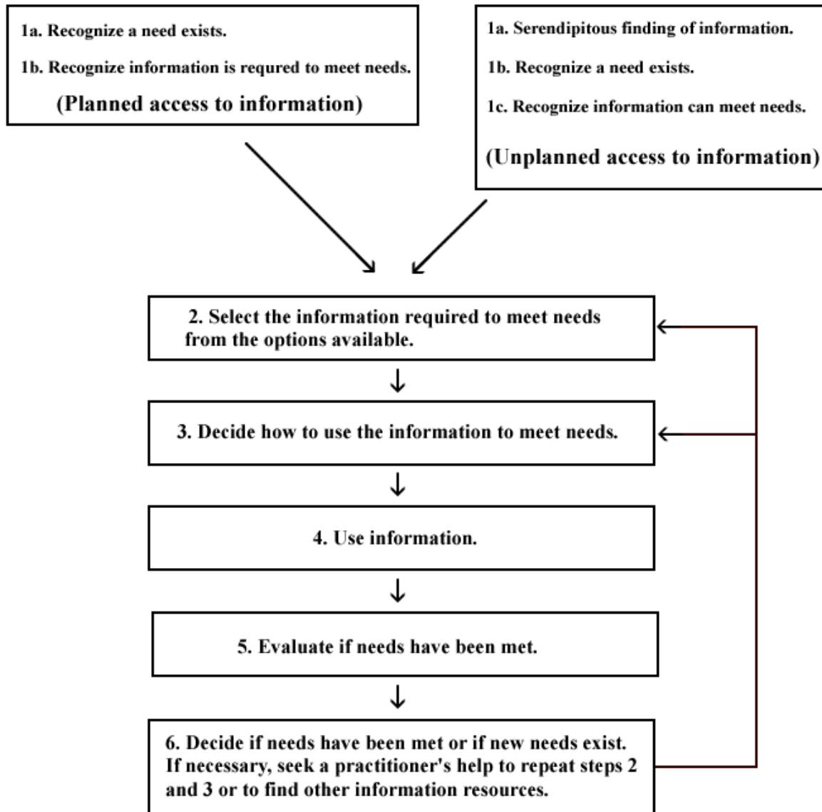
Figure 2. Six step process for effective information use.

Web-site designers can use this six-step process for effective information use to support users as they identify their needs and move through a Web site (Sampson, 1999). This process is aligned with the events of instruction described by (Gagné, 1988). These events and how they support the process of information use by the user are described in the succeeding paragraphs.